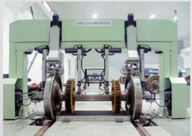
Wheel-set inspection in Work shops without dismantling wheels from axles.