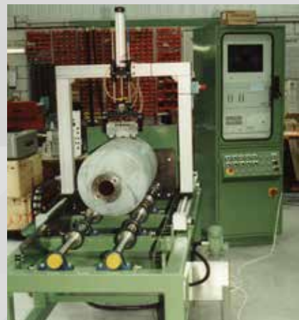
Gas bottle inspection