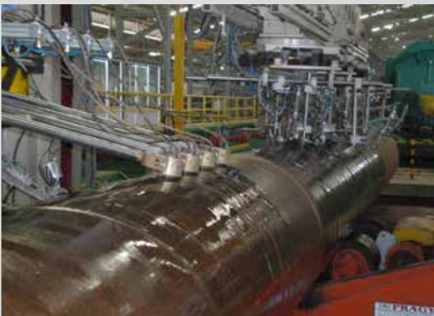
Spiral welded pipe inspection