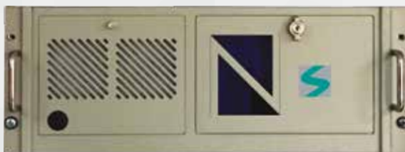
Integrated PCI card USPC7100MHA+

To highlight on the quality, the PCMUX7108HA+ comes with a real time A & C-Scan data acquisition per channel.