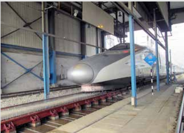
Dynamic testing – wayside system for wheel inspection