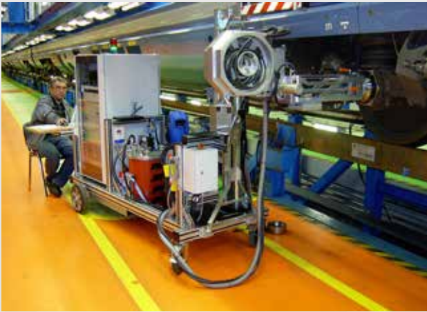
Shuttle hollow axles inspection